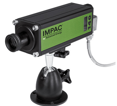
Advanced Energy's Impac 140 Series