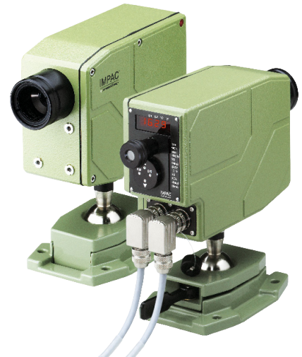
Advanced Energy's Impac IS 12-AI pyrometer

To monitor the strand temperature, an IGA 140/23 or IPE 140 in combination with an emissivity enhancer is used. Measuring temperatures from 5 and 50°C upwards, these pyrometers are the perfect units for the quenching process.