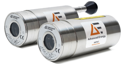
Advanced Energy's Impac IGA 6