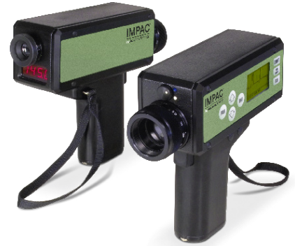
Advanced Energy's Impac IGA 8 plus